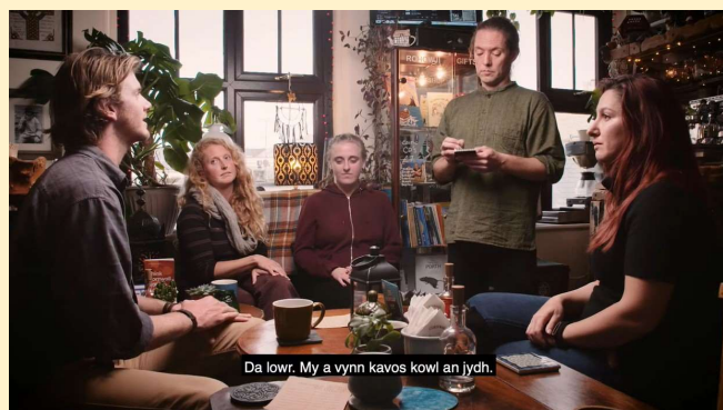
Da lowr. My a vynn kavos kowl an jydh.

The website also includes pdf downloads for the script, vocabulary and session notes. There is so much new online Kernewek learning material to help students besides the traditional Cornish language classes and even many of these are now on Zoom